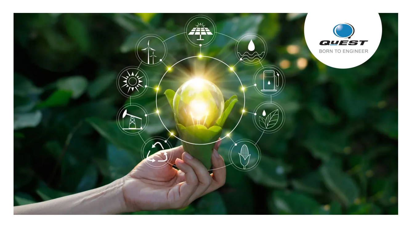
Engineering service providers catalyzing change in the race to 'net-zero'